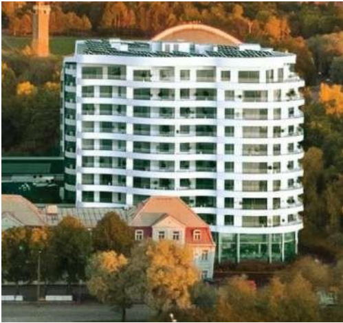
Tallinn, Estonia Project: MEERHOF 2.0 Type: Residential Year: 2019 Product: Multilayer Plumbing System