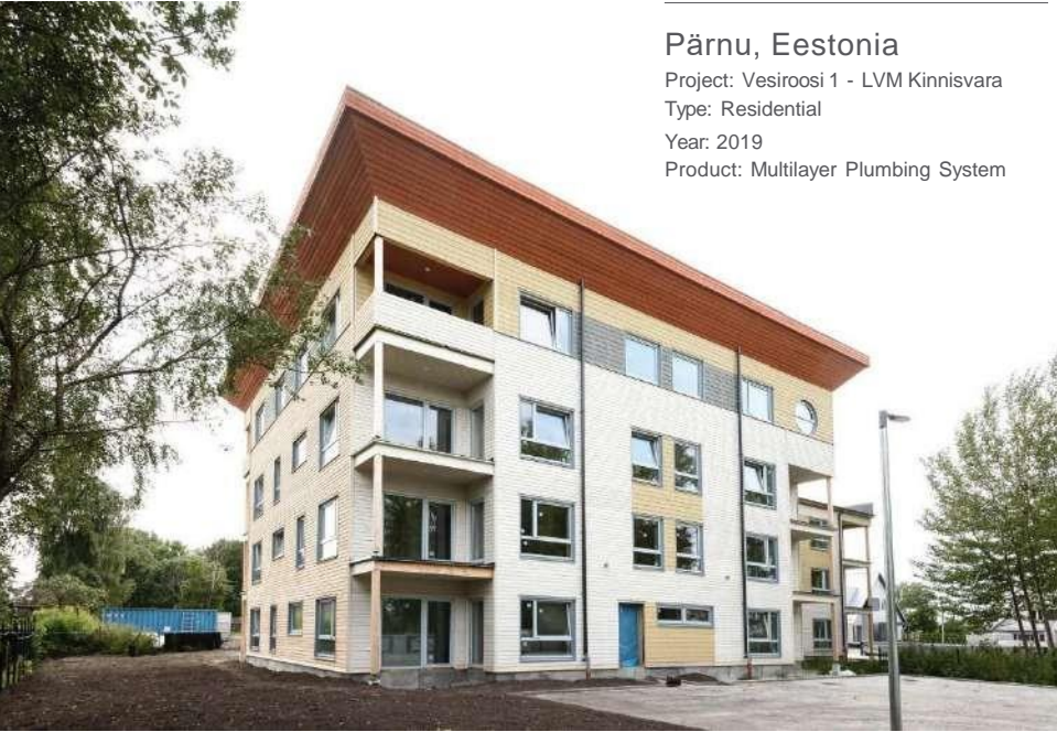
Pärnu, Eestonia Project: Vesiroosi 1 - LVM Kinnisvara Type: Residential Year: 2019 Product: Multilayer Plumbing System