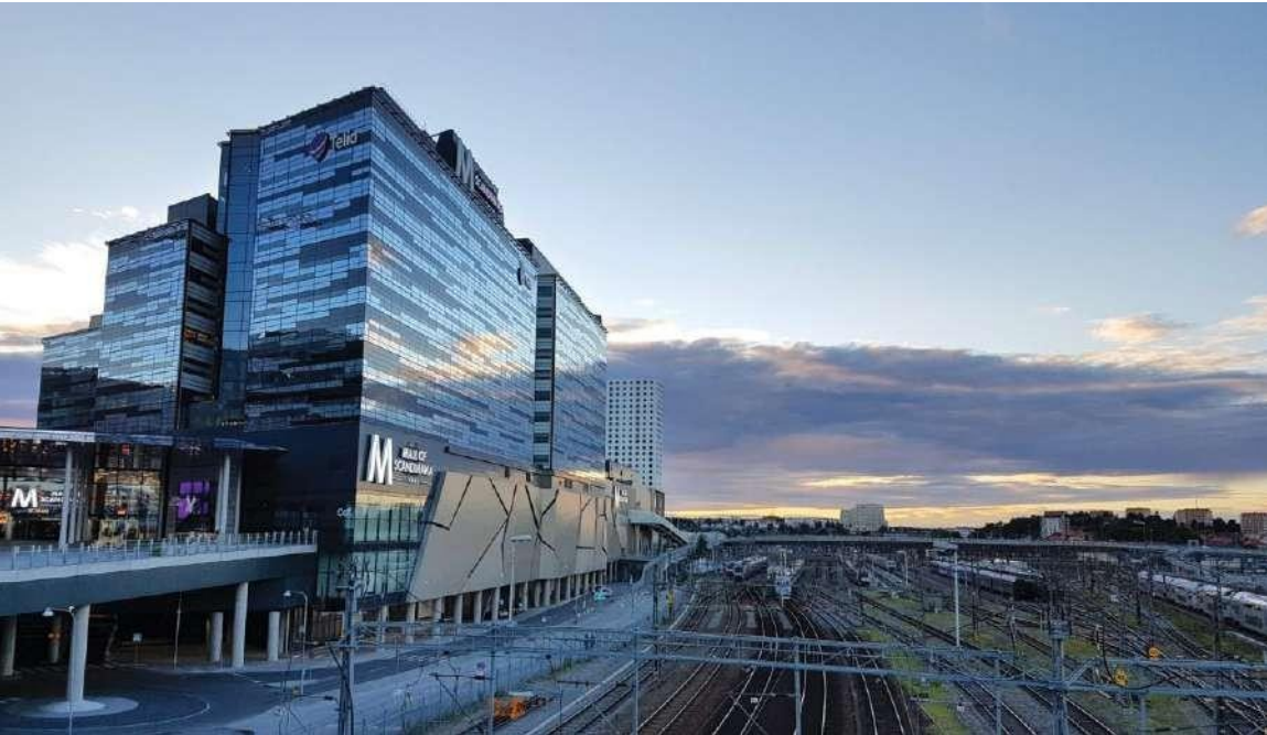
Solna, Sweden Project: Mall of Scandinavia Type: Commercial Year: 2015 Product: Multilayer plumbing System Underfloor heating System