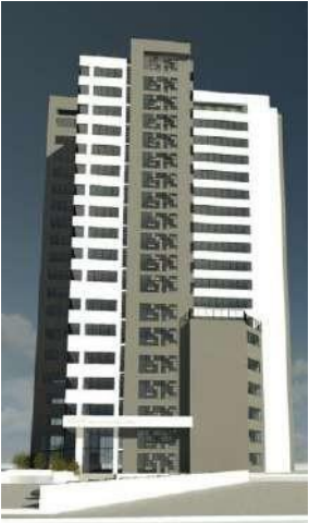
Bole, Ethiopia Project: MCO Commercial G+17 Building Type: Commercial Year: 2019 Product: Multilayer Plumbing System