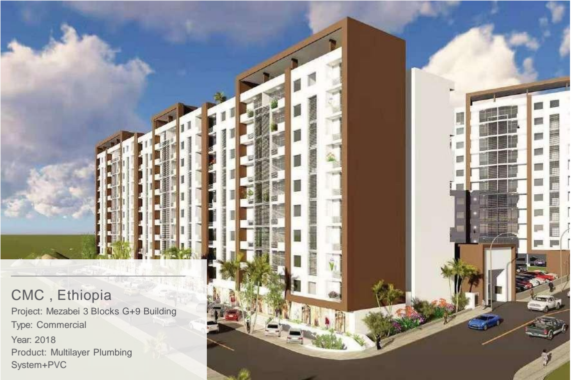
CMC , Ethiopia Project: Mezabei 3 Blocks G+9 Building Type: Commercial Year: 2018 Product: Multilayer Plumbing System+PVC