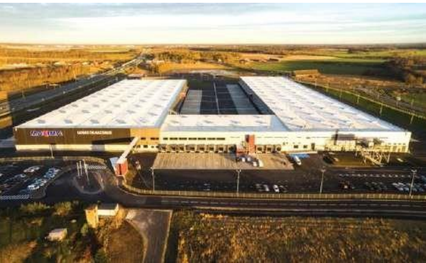
Tallinn, Estonia Project: MAXIMA Locistics Center Type: Commercial Year: 2019 Product: Multilayer Plumbing System