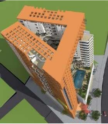
Kera, Ethiopia Project: Elilta Mix-use G+20 Building Type: Commercial Year: 2019 Product: Multilayer Plumbing System+PVC