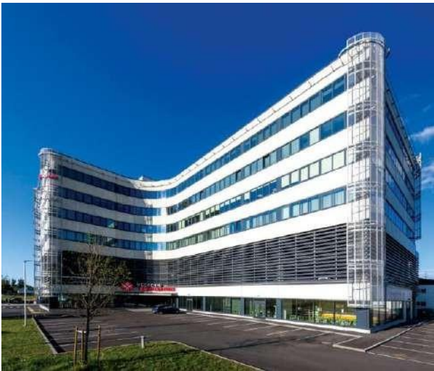
Tallinn, Estonia Project: Medical Lab SYNLAB in Veerenni 53A Type: Health Year: 2019 Product: Multilayer Plumbing System