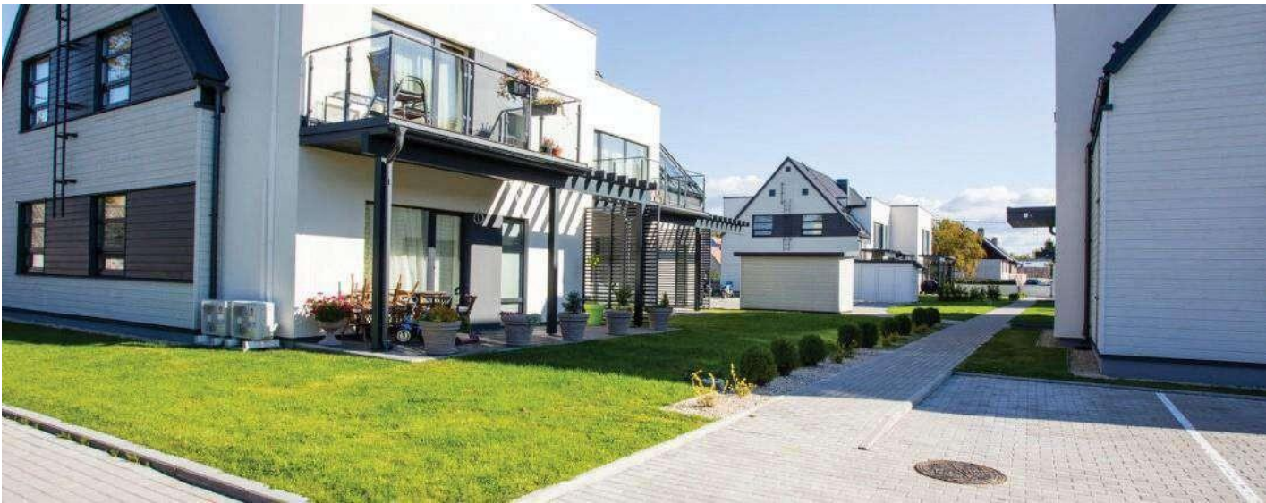
Pärnu, Eestonia Project: Pirmiaia aedlinnak – Oja 41d Type: Pirmiaia aedlinnak – Oja 41d Year: 2018 Product: Multilayer Plumbing System