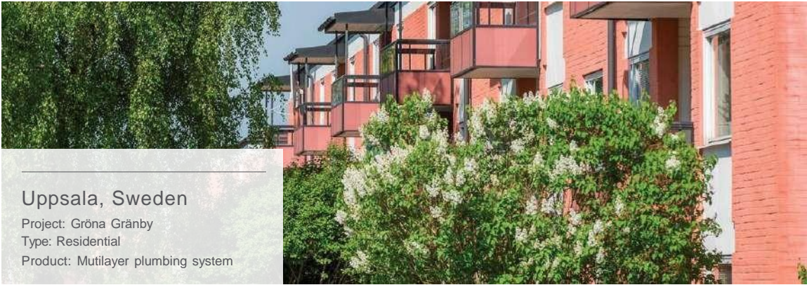
Uppsala, Sweden Project: Gröna Gränby Type: Residential Product: Multilayer plumbing system