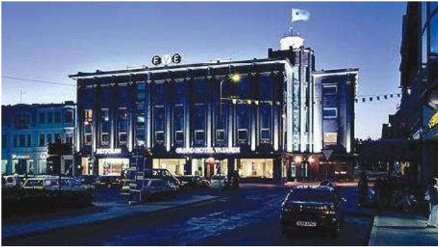
Tallinn, Estonia Project: Grand Hotel Viljandi Type: Hotels Year: 2019 Product: Multilayer Plumbing System