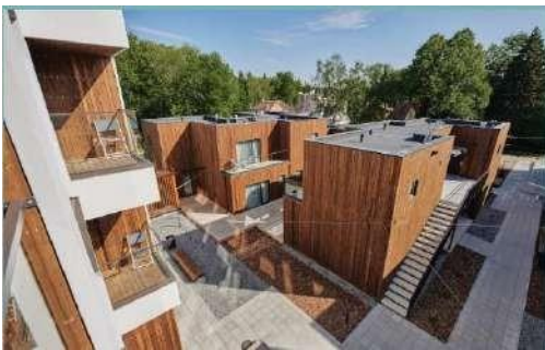
Pärnu, Eestonia Project: Wasa Resort Type: Hotels Year: 2019 Product: Multilayer Plumbing System