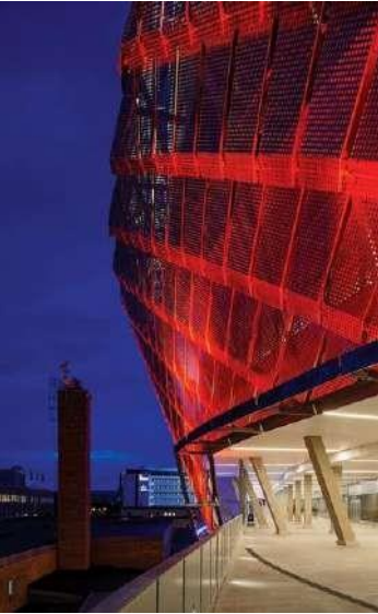
Project: Tele2 Arena Type: Sport Year: 2013 Product: Multilayer plumbing System Underfloor heating System