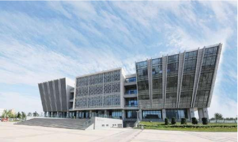
Cangzhou, China Project: Cangzhou Museum Type: Public Buildings Year: 2010 Product: PPR plumbing system

Cangzhou Museum opened in June, 2014. Covering with 32275 sq.m, the museum has 3 floors and mainly used for collection, display, education and communication.