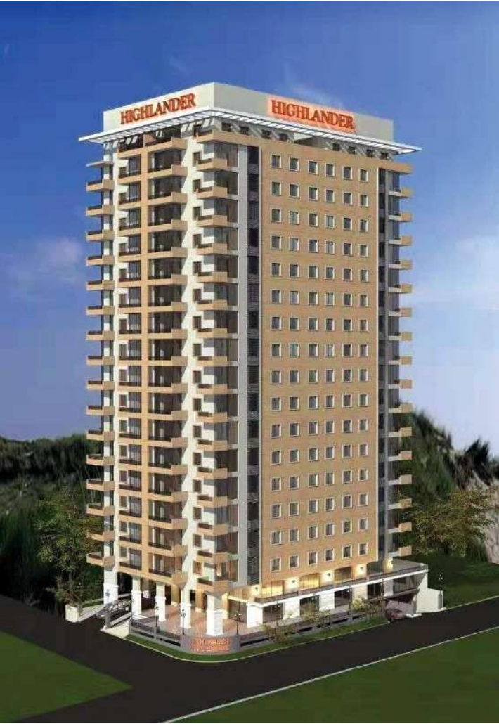
Kazanchis, Ethiopia Project: Highlander Luxury Apartment Type: Commercial Year: 2019 Product: Multilayer Plumbing System+PVC