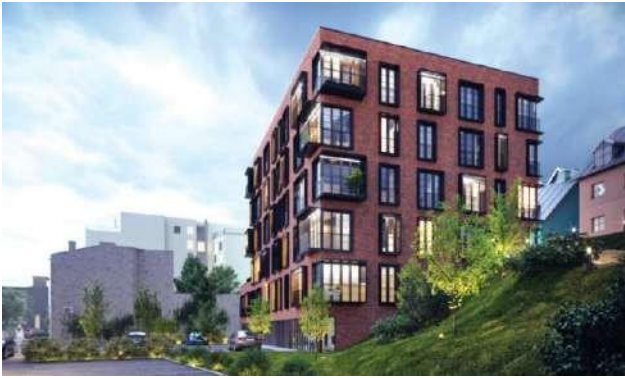
Tallinn, Estonia Project: Suur-Patarei 6 Type: Residential Year: 2019 Product: Multilayer Plumbing System