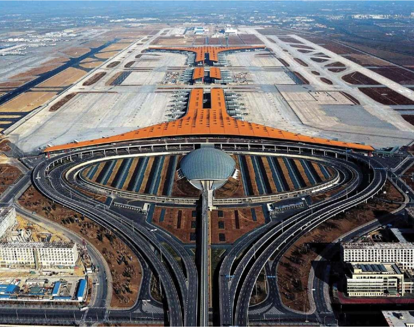
Terminal 3 of the BCIA was the largest airport terminal-building complex in the world to be built in a single phase, with 986,000 square meters in total floor area at its opening. It features a main passenger terminal and two satellite concourses, all of them five floors above ground and two underground.